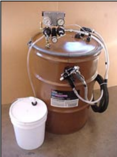
PLURAL COMPONENT SYSTEM

The System 5000 is a 55 gallon drum pressurization system. It is compatible only with 3M approved 55 gallon drums, containing water based adhesives. The regulated pressure valve mounted on the 3/4" drum bung hole pressurizes the drum to a maximum of 7 PSI. The drum pressurization valve assembly includes an adhesive pressure regulator and atomization regulator. The quick disconnect feature makes changing drums easy.