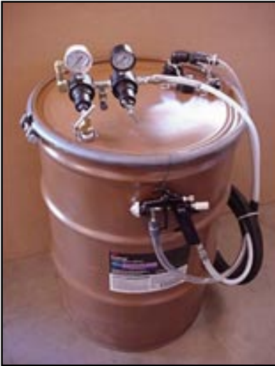
SINGLE COMPONENT SYSTEM

A simple way to deliver water based adhesives without pumps, pouring into pressure tanks or container elevation.